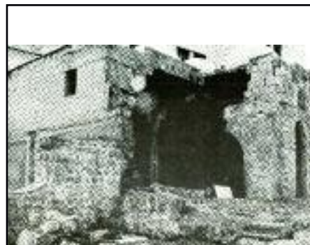
The Sayyed Abdallah Shrine after it was destroyed