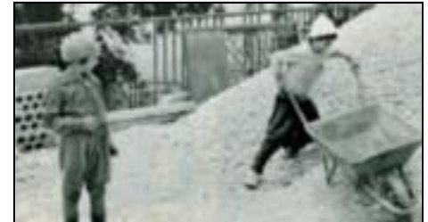
Children helping to rebuild their school

The civil war in Lebanon exploded during the late summer of 1975. As factions fought factions, villages and towns were bombed, shelled and leveled. There was no one area untouched by the fighting. Refugees were rampant throughout the country. Some found shelter at Beit el-Yateem.